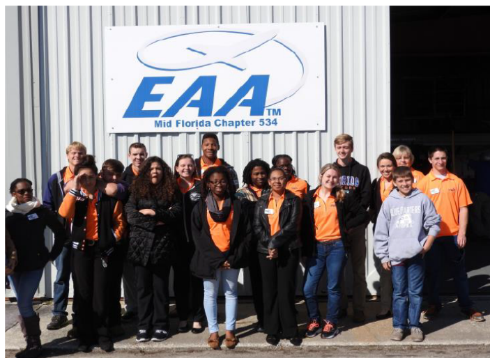
Leesburg High School SPARK students gather at the EAA Chapter 534 Hangar.