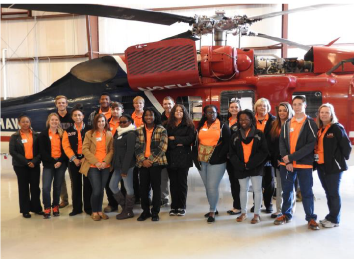
Leesburg High School's SPIRIT group pose in front of one of the new Firehawk helicopters of Brainerd